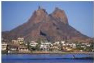
Sail the Ocean Blue